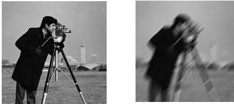
Image blur can also be caused by camera lens out of focus.

The image blurring can be modeled by a linear system: B = AX , where vector B is the blurred image, vector X is the original sharp image, and matrix A represents the blurring operation.